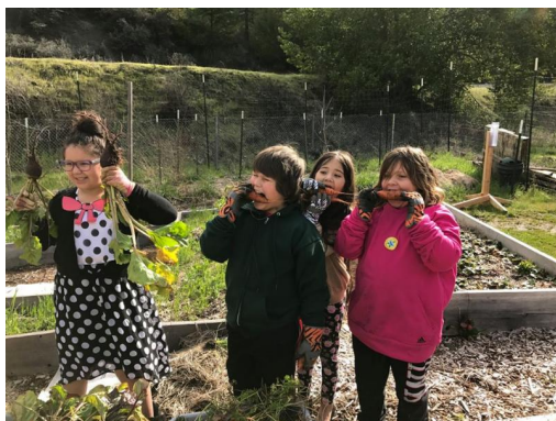
School gardening program.