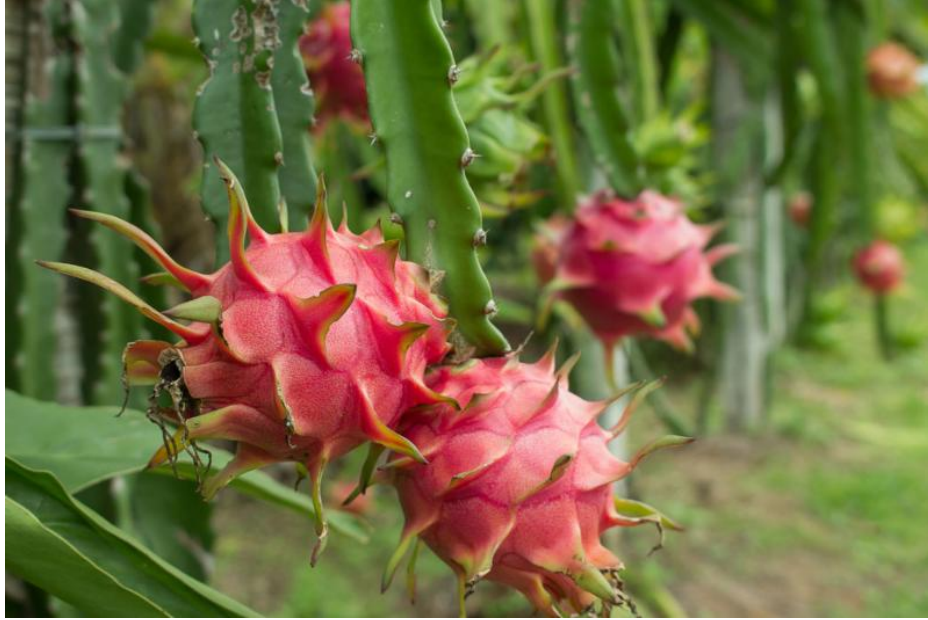
Dragon Fruit.

California's AB 626 will allow people to sell food made in "microenterprise home kitchens" beginning in January. Read the article in the LA Times.