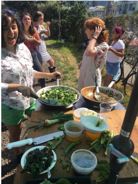
Cooking demo at the Oxford Tract.