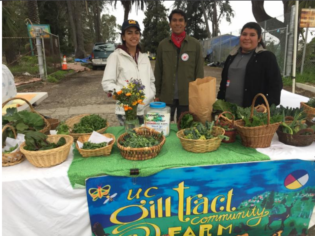
Free farmstand.

Latest research, upcoming workshops, news and events for the Growing Roots community!